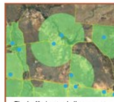
The buffering tool allows you to analyse grazing pressure in each paddock around your water points

Includes morning tea and lunch. Places are strictly limited. Please RSVP to avoid missing out. All workshops run from 8:30am - 4:00pm. Please RSVP by 02 August to allow sufficient time for processing.