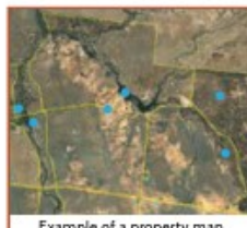
Example of a property map showing paddocks (yellow lines) and water points (blue dots)