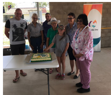
2019 Australia Day Celebrations in Jericho.