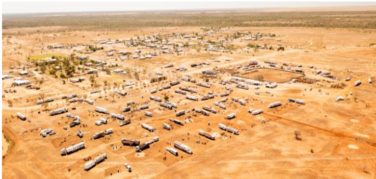
Drone image of the Muttaborra Campdraft.