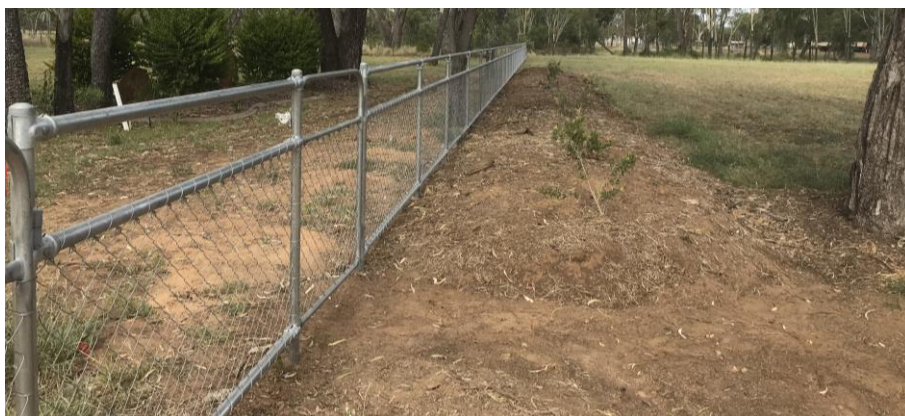
Jericho's new front fence at the Cemetery.