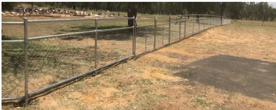
Alpha's new front fence at the Cemetery.

A little bit about the W4Q program: It is a Queensland Local Government state wide program that supports regional councils to undertake job-creating maintenance and minor infrastructure projects relating to assets owned or controlled by the council.