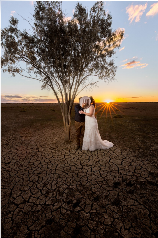
Love finds a way - Aaron Skinn