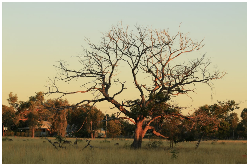
Golden feed for starving kangaroos - Jane Whitfield