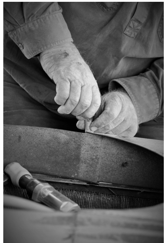
All which these hands have built - Leah Newton

Please visit the Facebook page to view and comment on the images, www.facebook.com/ourstrengthduringthedrought/ .