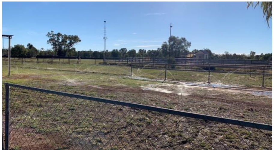
Automatic watering systems at the Jericho Showground.

The Jericho Showground is currently undergoing the installation of new automatic watering systems with Stage Three due to be completed within the next few months.