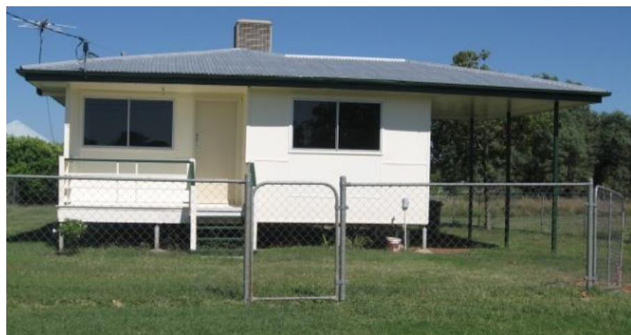
28 Porter Street, Aramac.