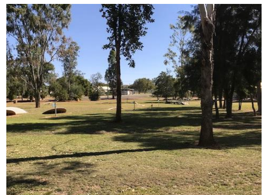
Settlers Park in Alpha.

Settlers Park in Alpha is currently undergoing the installation of new automatic watering systems with Stage three due to be completed within the next few months.