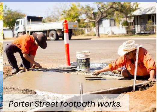
Porter Street footpath works.