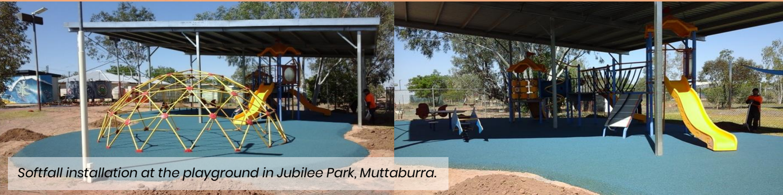
Softfall installation at the playground in Jubilee Park, Muttaborra.