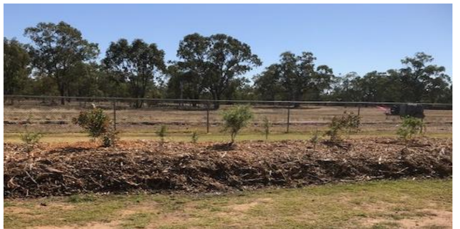
Gardens in Darwin Street, Jericho.

Council employees in Jericho have been busy this week in the main street revamping the gardens in time for spring.