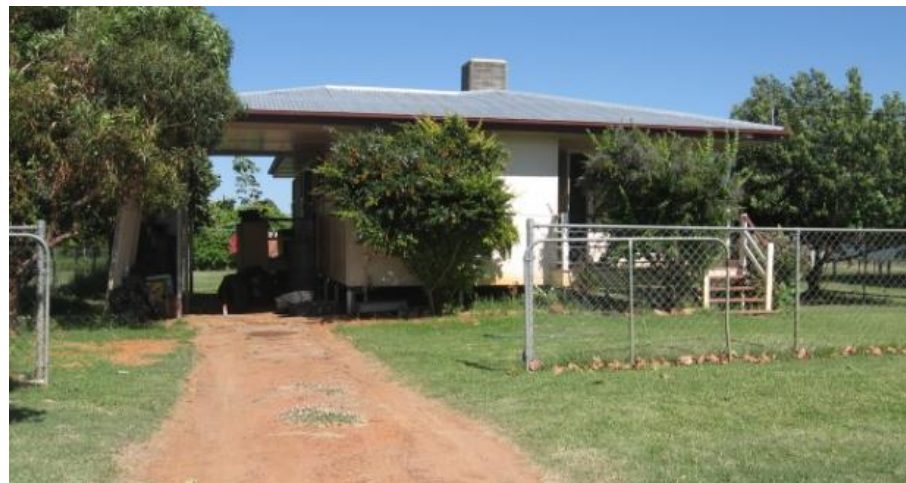
30 Porter Street, Aramac.