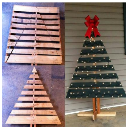
Example of pallet Christmas Trees for the community Christmas project.