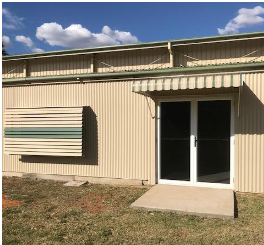
The Alpha Showground Grandstand and Kitchen awning.

The Alpha Showground Grandstand and Kitchen has recently undergone renovations with the installation of new awnings and is now available for hire and community use.