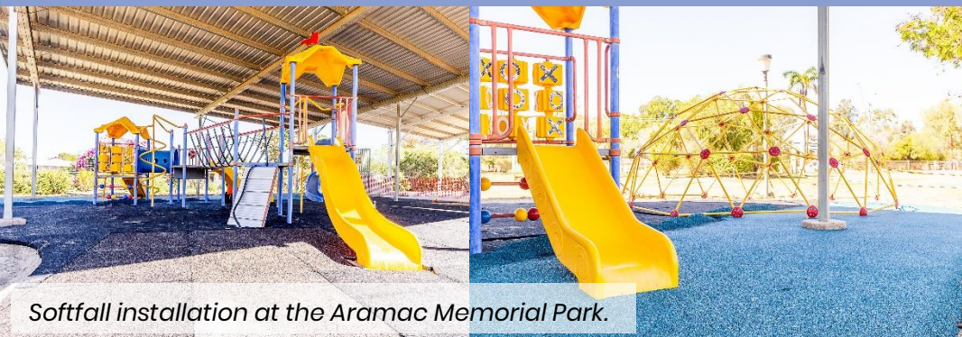
Softfall installation at the Aramac Memorial Park.