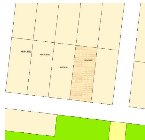
82-94 Lord Street