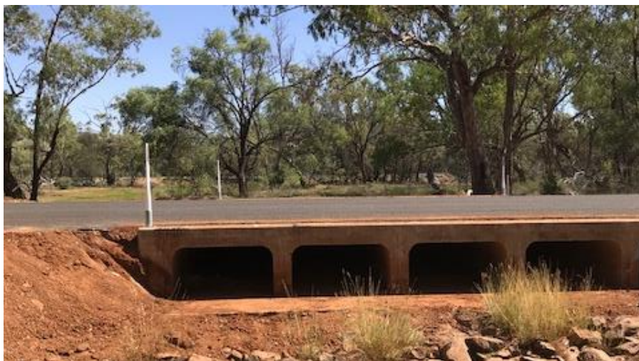
Construction of culverts on the Capricorn Highway west of Jericho.