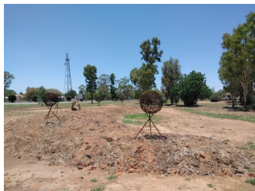
Barbed wire balls by Grumpy's Balls.