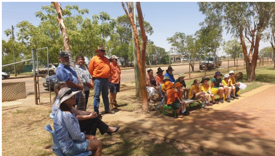
Remembrance Day service in Muttaborra.

A Remembrance Day service was held at the Muttaborra State School on Monday 11 November 2019. Students, teachers, residents, police and council representatives attended the flag raising ceremony in honour of members of the armed forces that have died in the line of duty. With beautiful speeches prepared by the school kids and a minute's silence observed, it was a dignified and proud display of respect.