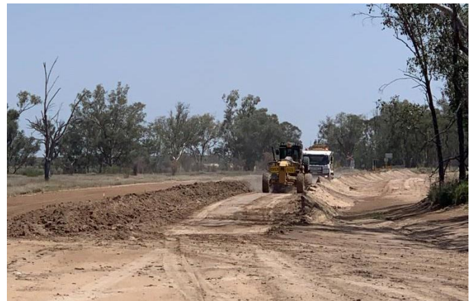
Pine Hill Roadworks, Alpha.