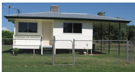
28 Porter Street, Aramac.