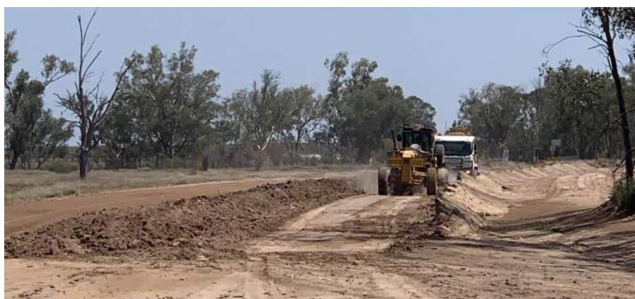
Pine Hill Roadworks, Alpha.

Work is continuing on Pine Hill Road with the prime expected to be completed on Wednesday 20 November 2019 and sealing expected to occur mid next week. Council strongly encourages all who navigate roadworks throughout the region to proceed with caution. Council appreciates your patience and cooperation whilst these works are completed.