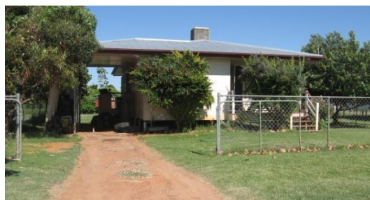
30 Porter Street, Aramac.