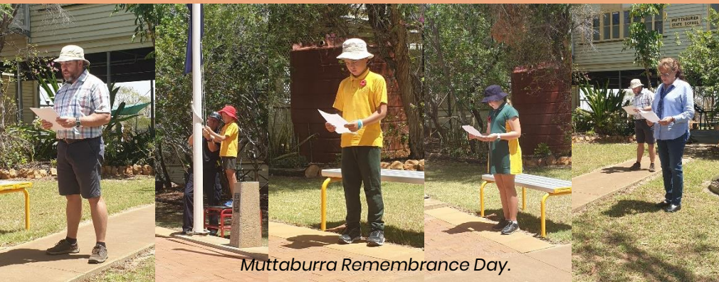
Muttaborra Remembrance Day.