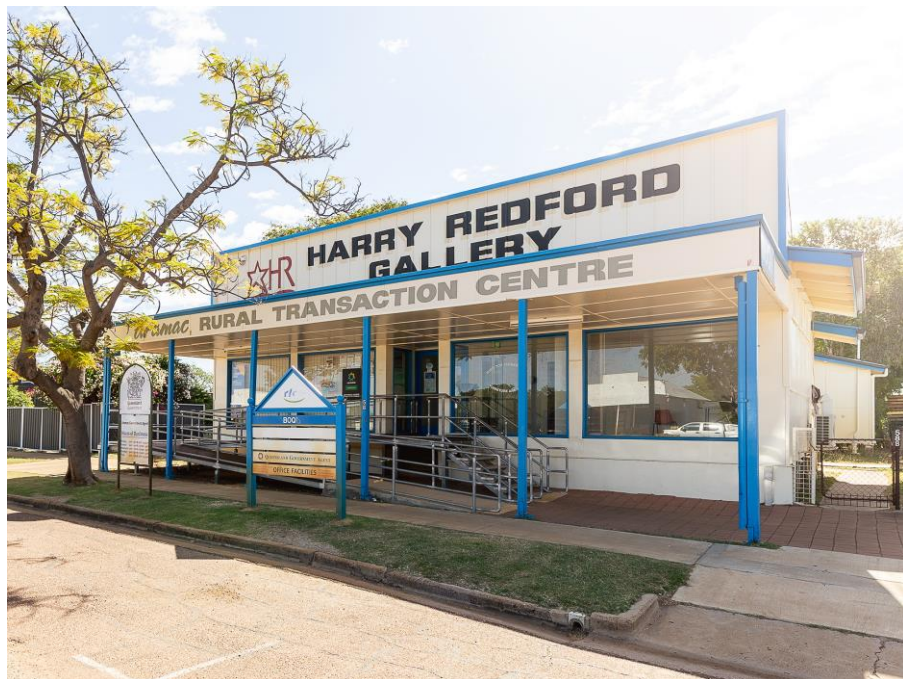
New library building at the Harry Redford Gallery.

After months of renovations and planning, the Ollie Landers Library in Aramac has finally been relocated to its new home in the Harry Redford Gallery. The new Library location is in a prime spot next door to the Bank of Queensland and will integrate with the Harry Redford Interpretation Centre, creating a new centre for locals and visitors to meet.