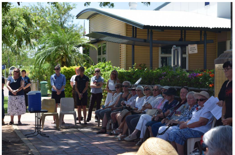
Remembrance Day service in Barcaldine.