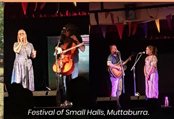
Festival of Small Halls, Muttaborra.