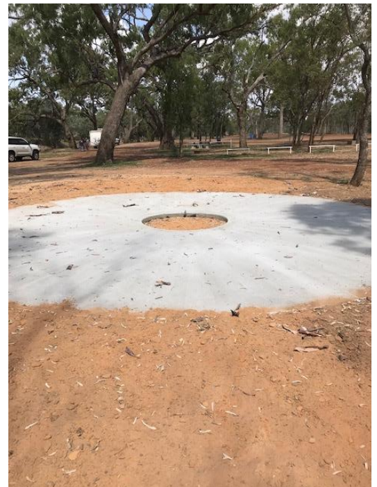
New fire pit construction at Redbank Park, Jericho.

Work has recently commenced in Jericho at Redbank Park on the construction of a new fire pit.