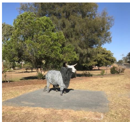
Barbed Wire Bull at Settlers Park, Alpha.