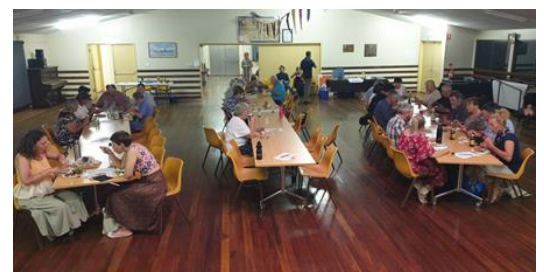
Festival of Small Halls in Muttaborra.

A large crowd enjoyed a night of incredible music and entertainment on Saturday 9 November 2019 when the Festival of Small Halls visited Muttaborra. Two acts originating from Australia and Scotland graced the stage and left the audience wanting more. The Festival of Small Halls is an annual tour run by the Dorrigo Folk and Bluegrass Festival and Queenscliff Music Festival. Each year, bands that play at the festivals are organised to tour regional areas bringing the music to smaller communities. The Muttaborra Community Development Association also provided some incredible food for the event.