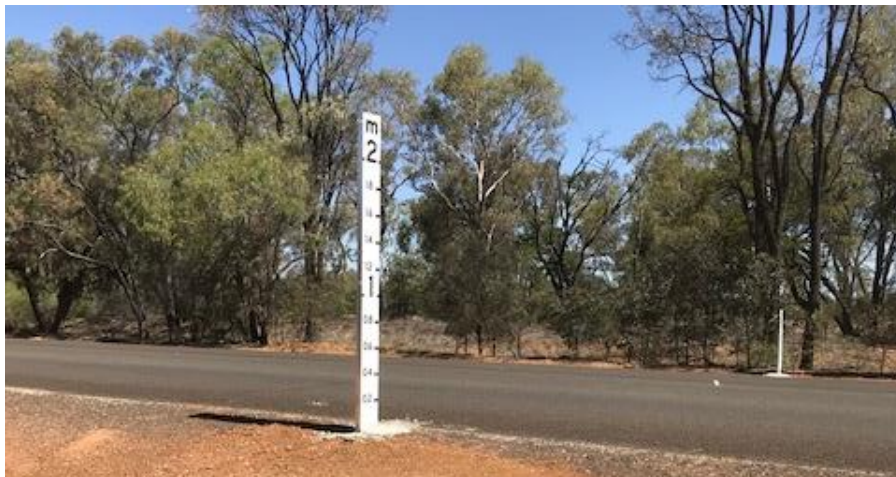
Installation of guide posts on the Capricorn Highway west of Jericho.

Work is continuing on the Jericho Road with the construction of culverts and the installation of new signs and guide posts. Council strongly encourages all who navigate roadworks throughout the region to proceed with caution. Council appreciates your patience and cooperation whilst these works are completed.